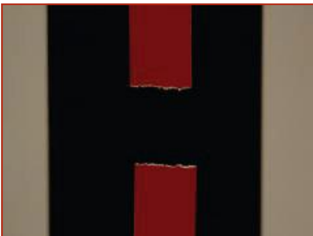
Sample after test