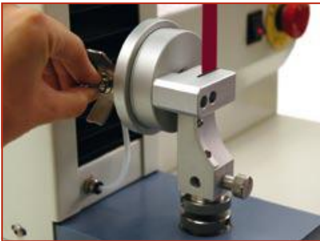
MTC-100 pneumatic clamps